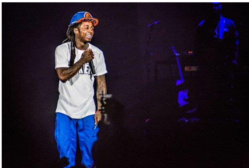
Figure 1: Lil Wayne

Some famous rappers in the modern music industry include Eminem, Drake, Lil Wayne, Rakim, Kayne West, Jay-Z, and Wiz Khalifa