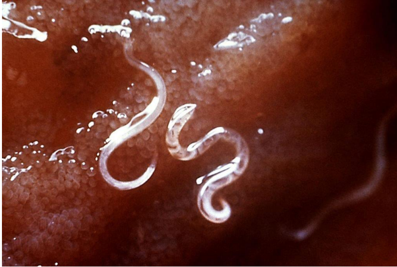
Figure 02: Hookworm

Oral medications are administered during hookworm infection in regular prescribed doses. The disease is diagnosed by examining the feces for hookworm eggs. It is important to maintain good health habits, including washing hands and feet after walking on soil and washing hands before and after meals. The infection can be prevented by creating awareness on public health.