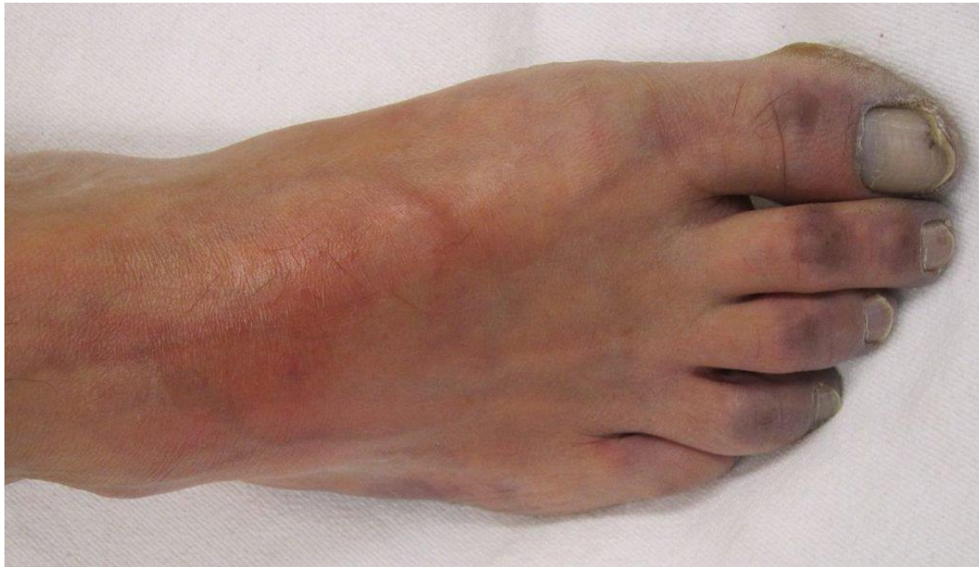
Figure 01: Ischemia in Lower Limbs

These changes are reversible if the hypoxia is corrected within 30-40 minutes from the onset of ischemia.