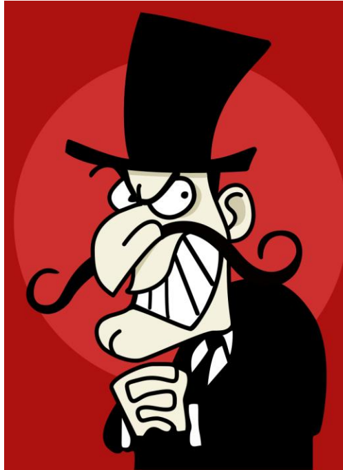
Figure 2: Villains in popular literature are typically considered as evil.

However, it is important to know the difference between good and evil is always subjective. What one may view as good may be seen as evil by another person. But there are behavior or actions that are generally considered to be evil. For example, taking someone's life is often considered as an evil action.