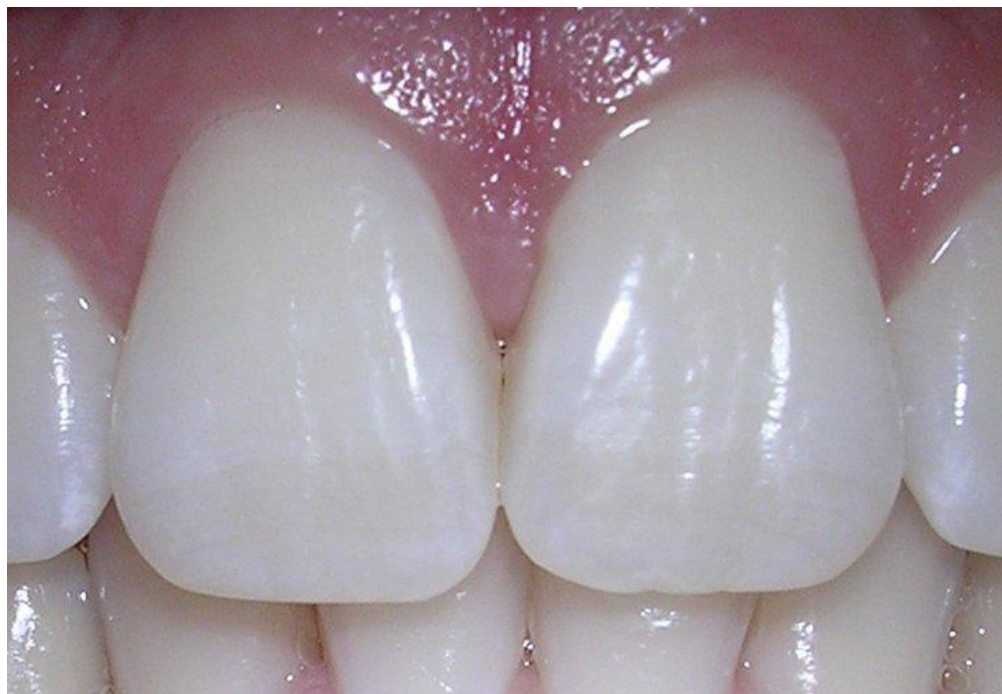
Figure 01: Maxillary Central Incisor

Maxillary central incisors are situated in the center of the maxilla, and two central incisors are situated on either side of the mid line. The main function of maxillary central incisors is to cut the food during mastication of mechanical digestion to form the food bolus.