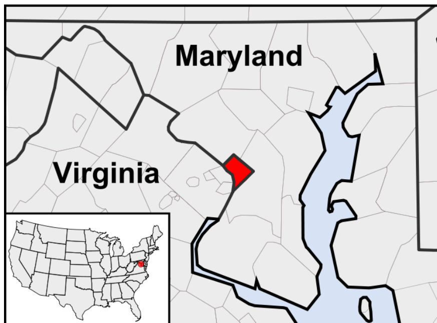
Figure 01: Location of Washington DC

Washington DC, located along the Potomac River on the East Coast, is the capital of the United States of America. The state of Virginia borders it on the southern shore of the Potomac River and the state of Maryland borders it to the north, east, and west. The abbreviation DC stands for District of Columbia. Washington DC was founded in 1791 and was named after George Washington, the first US president. This region does not belong to any state. However, the federal district was created with lands donated by states of Virginia and Maryland.