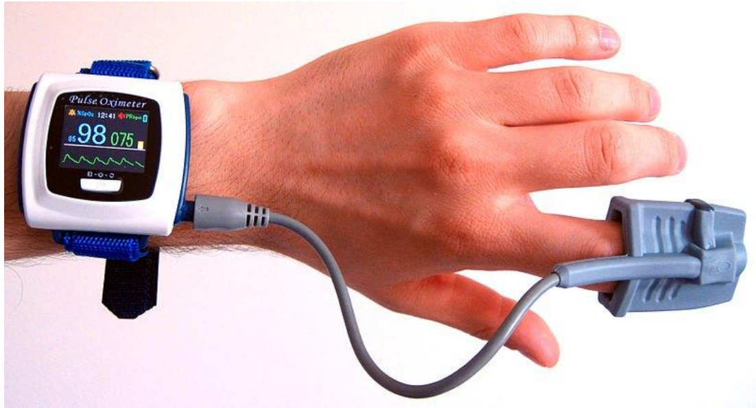
Figure 01: Oxygenation using pulse oximeter

The hyperbaric oxygenation is the situation of the increased amount of oxygen in an organ or tissue due to the external administration of oxygen to a person in a compression chamber at an ambient pressure that is greater than the normal atmospheric pressure. The pulse oximeter is the principle instrument measuring the adequate oxygenation in a patient. So, oxygenation is considered as an artificial phenomenon that keeps a patient healthy.