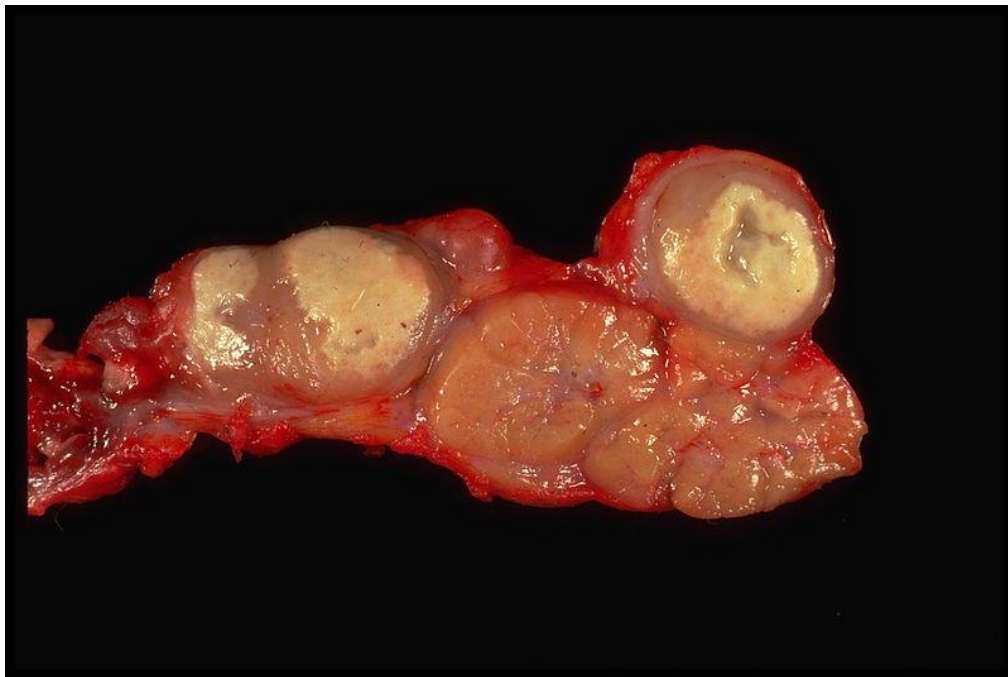
Figure 02: Tuberculous Lymphadenitis