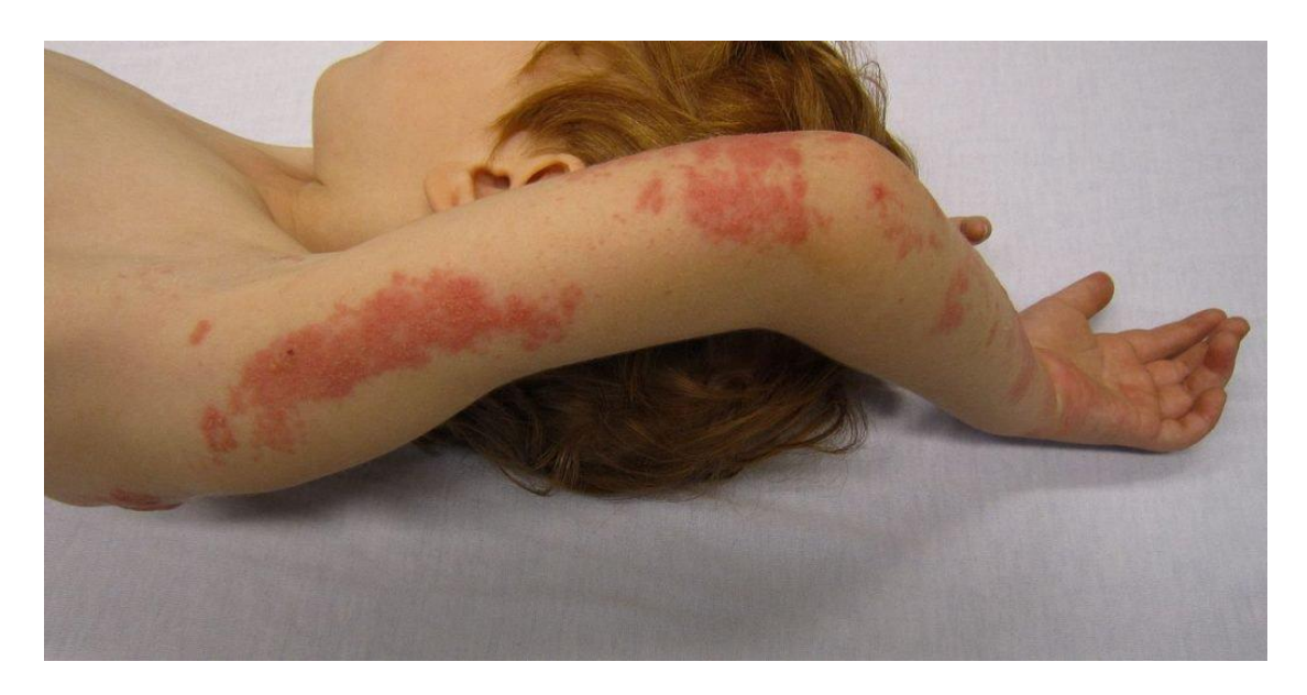
Figure 02: Shingles