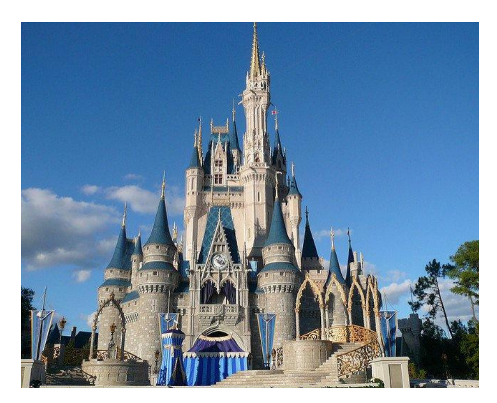
Figure 01: Cinderella Castle