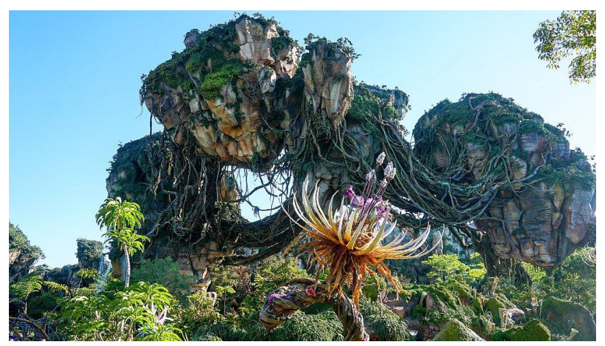
Figure 06: The World of Avatar at Disney's Animal Kingdom

Animal Kingdom is home to about 1700 animals belonging to various species. Some of these animals include hippopotamus, African elephants, crocodiles, lions, deer, giraffes, and rhinoceros.