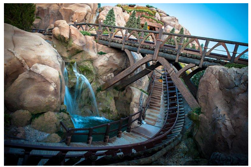
Figure 02: Seven Dwarfs Mine Train

You can also meet a variety of characters such as Peter Pan, Mickey Mouse, Alice, Cinderella, Rapunzel, Snow White, Mary Poppins and Aladdin in this theme park. Magic Kingdom also has a selection of restaurants and cafes, providing a unique dining experience. Crystal Palace, Cinderella's Royal Palace, Be Our Guest, Casey's Corner, Cosmic Ray's, and Gaston's Tavern are some of these.