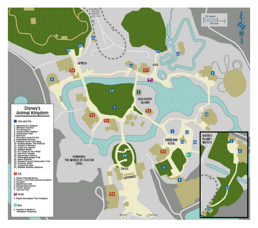
Figure 05: Map of Disney Animal Kingdom