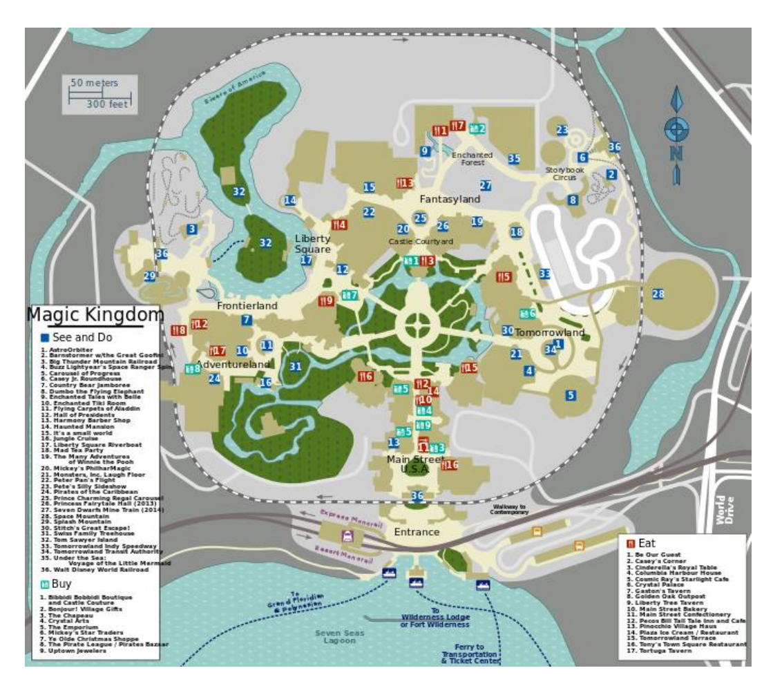
Figure 03: Map of Magic Kingdom

Magic Kingdom also hosts special events such as Mickey's Not-So-Scary-Halloween Party, Mickey's Very Merry Christmas Party, and Happily Ever After Fireworks throughout the year.