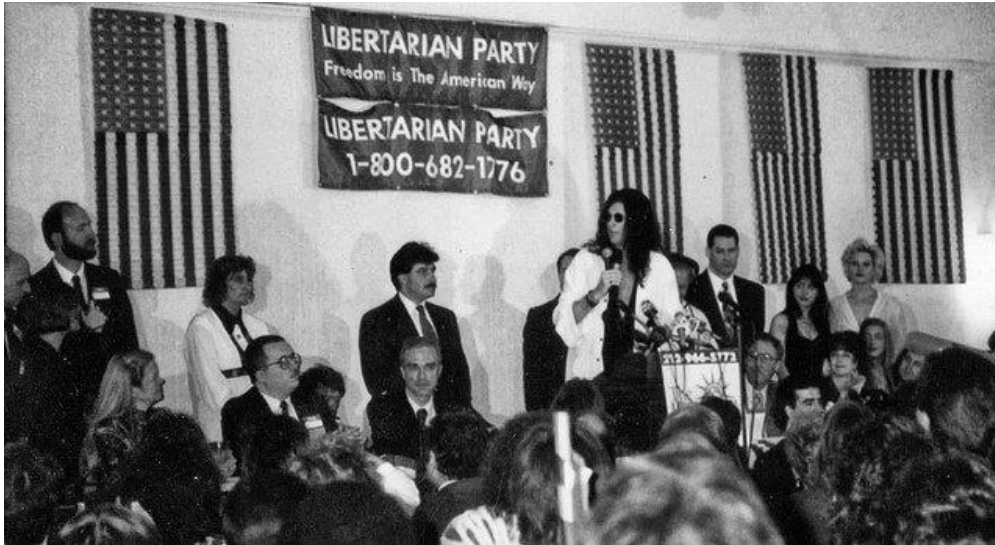
Fig 01:Howard Stern Libertarian Party

Their motto is “Live and lets Live.” which is suggestive of the fact that people are free to do any form of activity ranging from eating, smoking, taking drugs, having varied sexual preferences in life with anyone they like as long as they don’t harm anyone. They simply don’t believe either in the existence of a government (to interfere with an individual's free will) or in the process of electing.