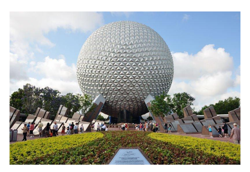
Figure 01: Spaceship Earth

Epcot (Experimental Prototype Community of Tomorrow), opened in 1982, was the second theme park to be built to in the Walt Disney World. This park spans an area of 120ha and is twice the size of Magic Kingdom. Themed after technological innovation and international culture, Epcot is a celebration of human achievements. This theme park is represented by Spaceship Earth (a geodesic dome).