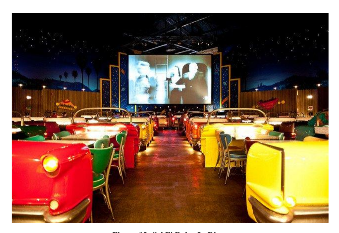
Figure 03: Sci Fi Drive In Diner

Hollywood Studios also feature famous Disney characters such as Olaf, Buzz Lightyear, and Woody. Some of the restaurants in this park include The Hollywood Brown Derby, Mama Melrose's Ristorante, 50's Prime Time Café, Sci-Fi Dine-In Theater, Hollywood and Vine, and Hollywood Waffles of Fame.