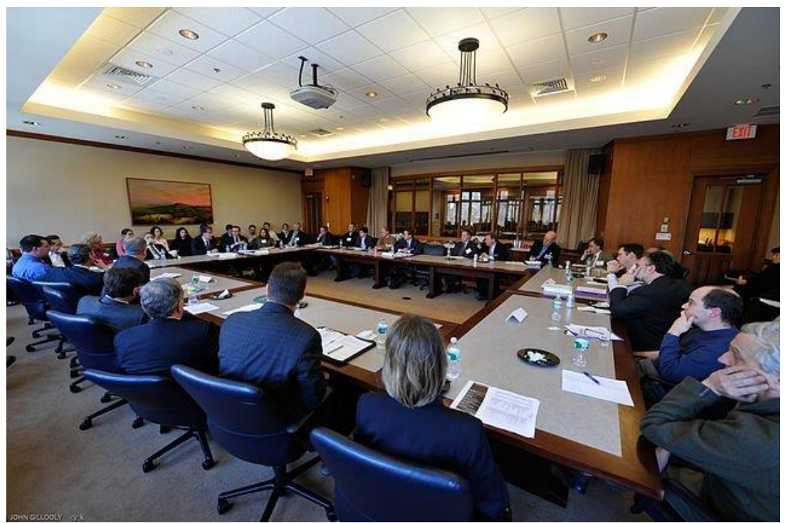
Crisis management is a reactive process

Crisis management will deal with ensuring how to face to above tense situations if they arise any time without a prior notifying. The process will include activities and steps that help management and all employees to analyse and understand events that lead to uncertainty within the organisation.