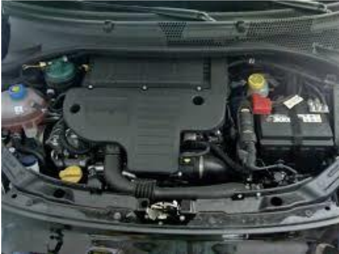
Fig 1. Various modifications are done in the engines of new automobiles as a response to the new environmental proposal to minimize carbon emission that pollutes the environment.

As defined in Merriam Webster, modification has several meanings as “the making of a limited change in something, a limitation or qualification of the meaning of a word by another word, by an affix or by internal change”. Refer the given examples