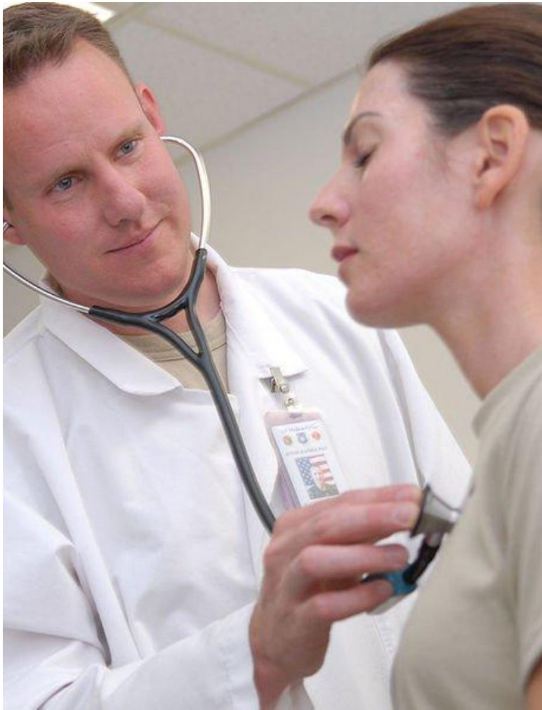
Figure 01: Auscultation of a woman