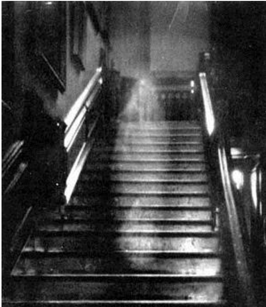
Figure 02: A photograph claiming to capture the image of a ghost.

The idea of ghosts exist in many cultures and countries; folklore, myths, and legends about ghosts can be found all over the world. The depiction of ghosts in them may be different, but the basic concept about ghosts, i.e., ghosts being spirits or souls of dead people, can be noted in all these stories. The concept of ghosts is also used in popular literature in many cultures; for example, many horror films contain ghost stories as their plots. Ghost stories or the presence of ghosts can be also traced in classical literature; ghosts in Shakespeare's Hamlet and Macbeth are prime examples for this.