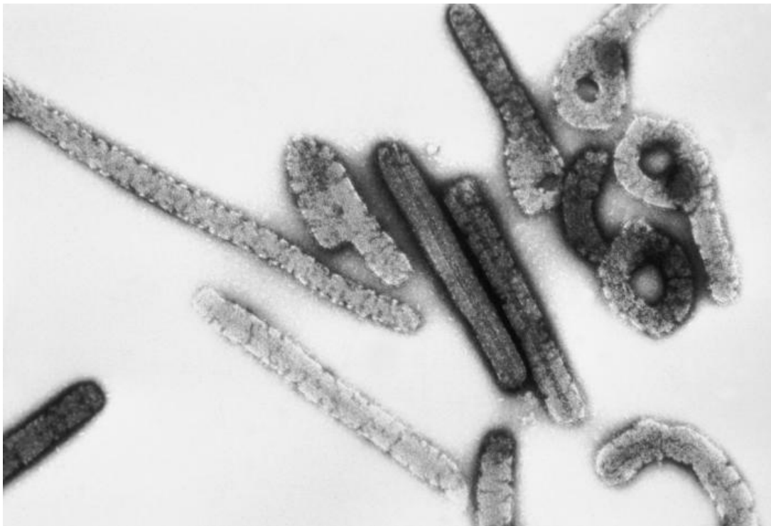
Figure 02: Marburg Virus

The Marburg virus is transmitted by direct contact. Agents include blood, body fluids, and tissues of infected persons. Transmission of the Marburg virus also occurs by handling ill or dead infected wild animals mainly monkeys and fruit bats.