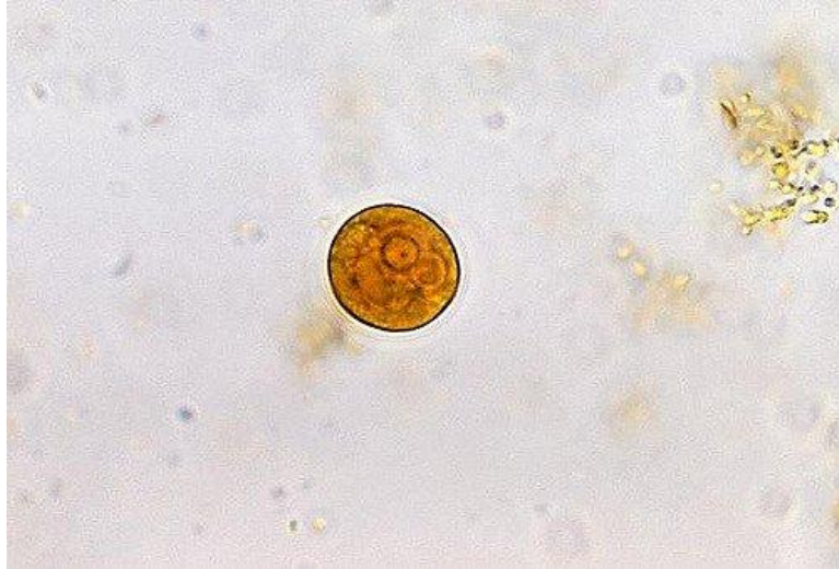
Figure 01: Entamoeba Histolytica Cyst

Cysts are infectious particles and are involved in causing diseases to humans and other organisms where the causative agent is a protozoan. Some disease causing protozoans involved in cyst formation include: