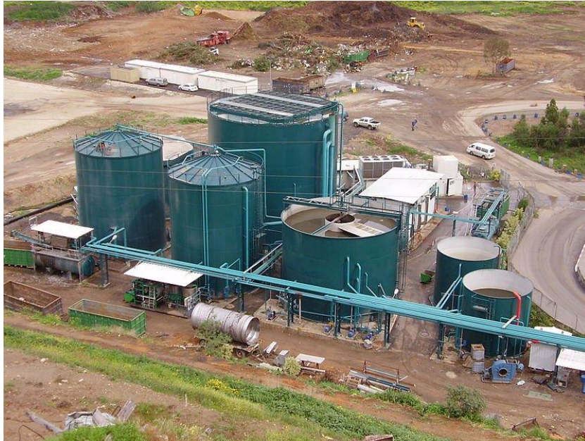
Figure 02: Anaerobic Wastewater Treatment

Anaerobic wastewater treatment process occurs via four major steps named hydrolysis, acidogenesis, acetogenesis, and methanogenesis. All these steps are governed by anaerobic microorganisms, especially bacteria and archaea .