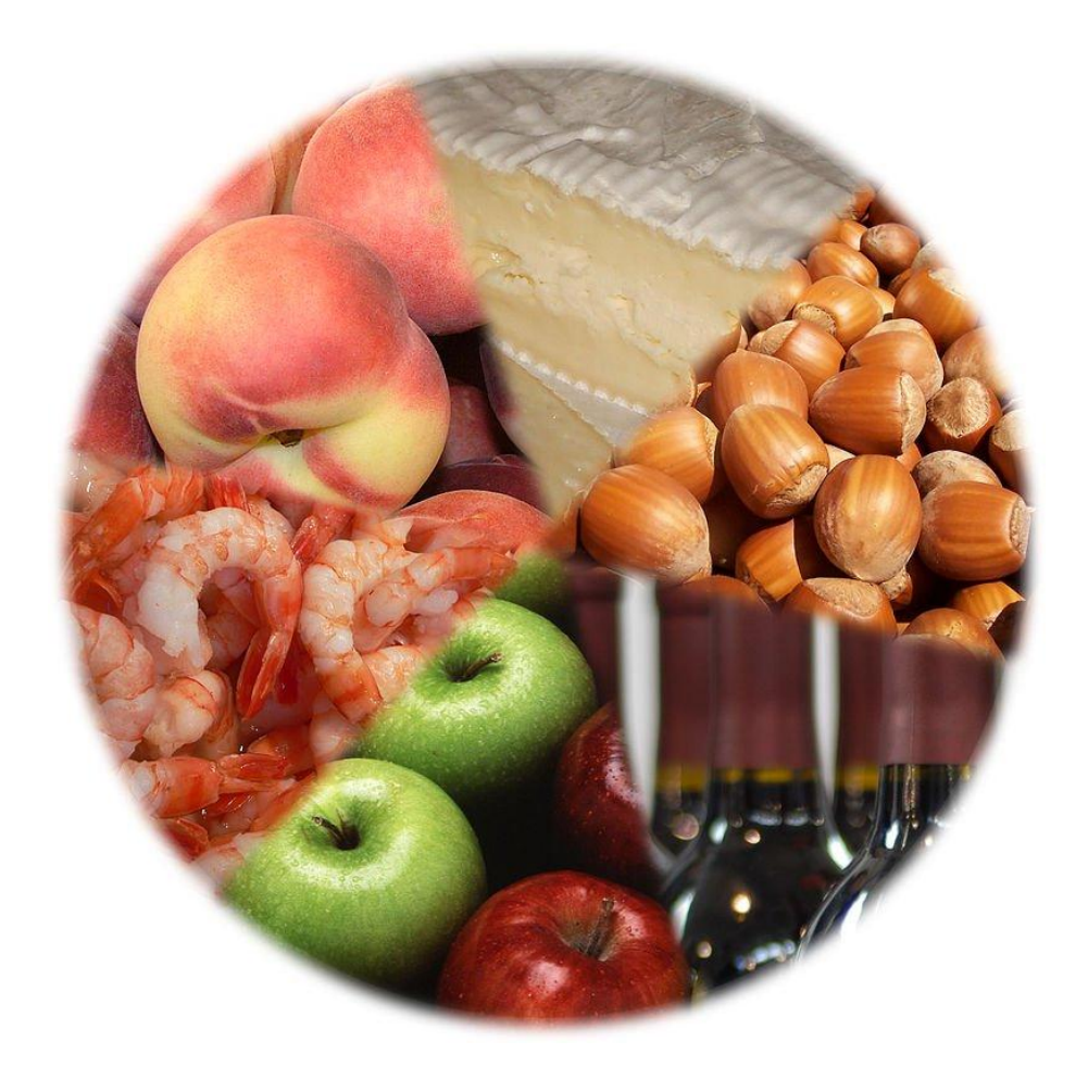
Figure 02: Some common food that triggers allergies.