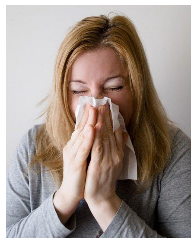
Figure 02: Walking Pneumonia is less severe that Pneumonia