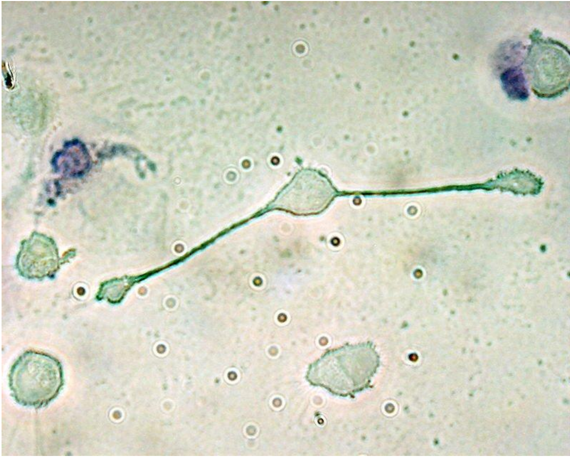
Figure 01: Macrophage

Macrophages are formed from monocytes which are produced from the stem cells of bone marrows. They circulate through the blood stream and leave the blood after becoming mature.