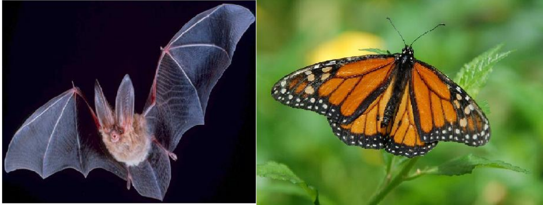
Figure 02: Analogous structures