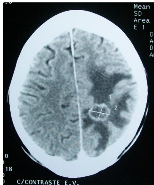
Figure 02: Edema (darker areas) surrounding a secondary brain tumor.

An edematous brain has flattened gyri and narrow sulci.