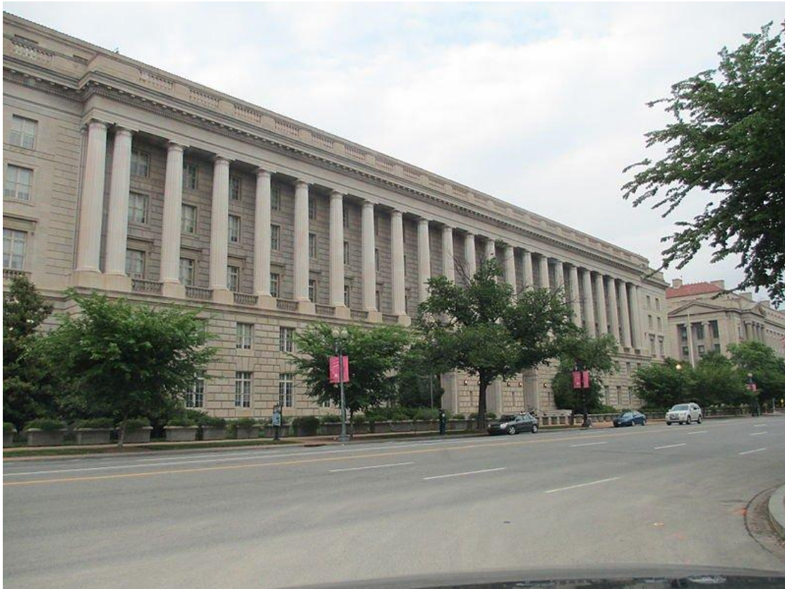
Figure 02: Home of the Internal Revenue Service

Once received, the individuals must use SSN for tax purposes and discontinue ITIN. This can be done through notifying IRS; following this all tax records can continue to be filled under one identification number, which is the SSN.