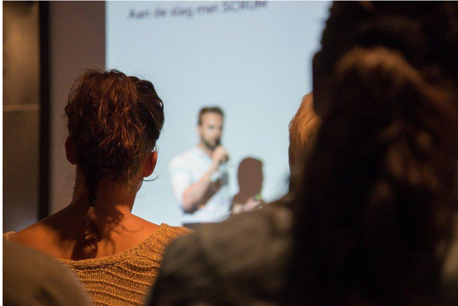
Figure 01: Training and development is an example of discretionary fixed costs.

It should be noted that if a business continues to curtail or postpone discretionary fixed costs for a long time, generally exceeding one year, this will have a negative impact on the competitiveness of the business. For instance, in ABC Company above, lack of employee training can result in declining employee effectiveness. Therefore it is important for companies to ensure fixed costs are only curtailed over a relatively short period to time.