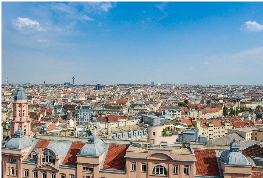
Figure 02: Vienna is ranked as the city with the highest standard of living in 2017 by the Business Insider.